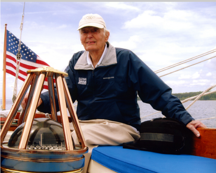
Olin Stephens sailing Falcon – Castine 2007.