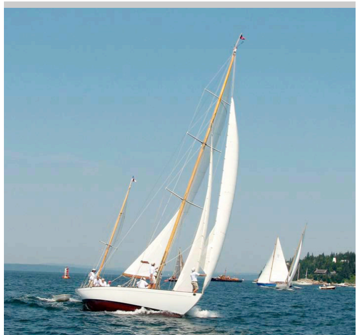
Dorade maneuvering at start – Castine 2007.