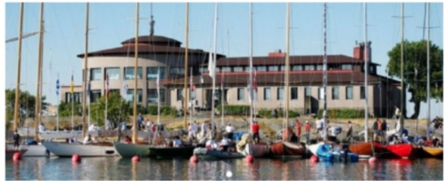
Helsingfors Segelsällskap HSS

Possible place for Registration and welcome at Lonna Island or Löyly restaurant http://www.lonna.fi/en/lonna/ http://www.loylyhelsinki.fi/en/front-page/